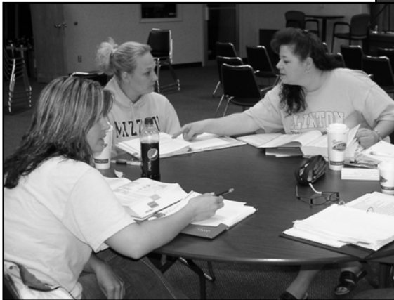
Studying for the Final Final