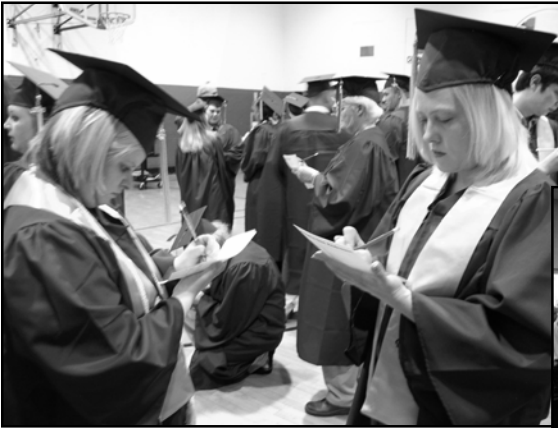
Last Minute Preparations