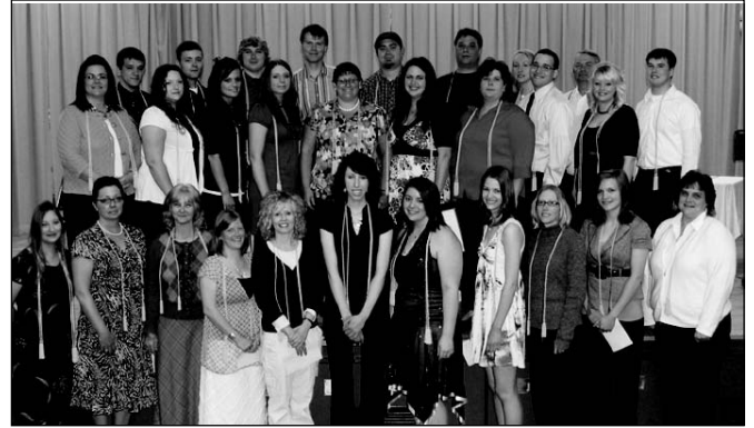
Congratulations to CCC graduates recognized for their academic achievement at the 2010 Honor Cording ceremony.