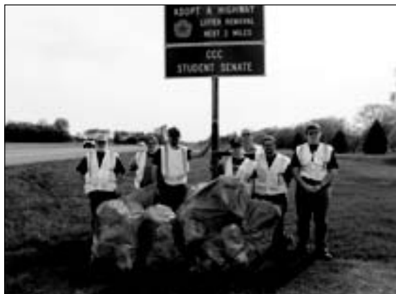
Kudos to members of CCC Student Senate for their cleanup of Highway 67 near Camanche.