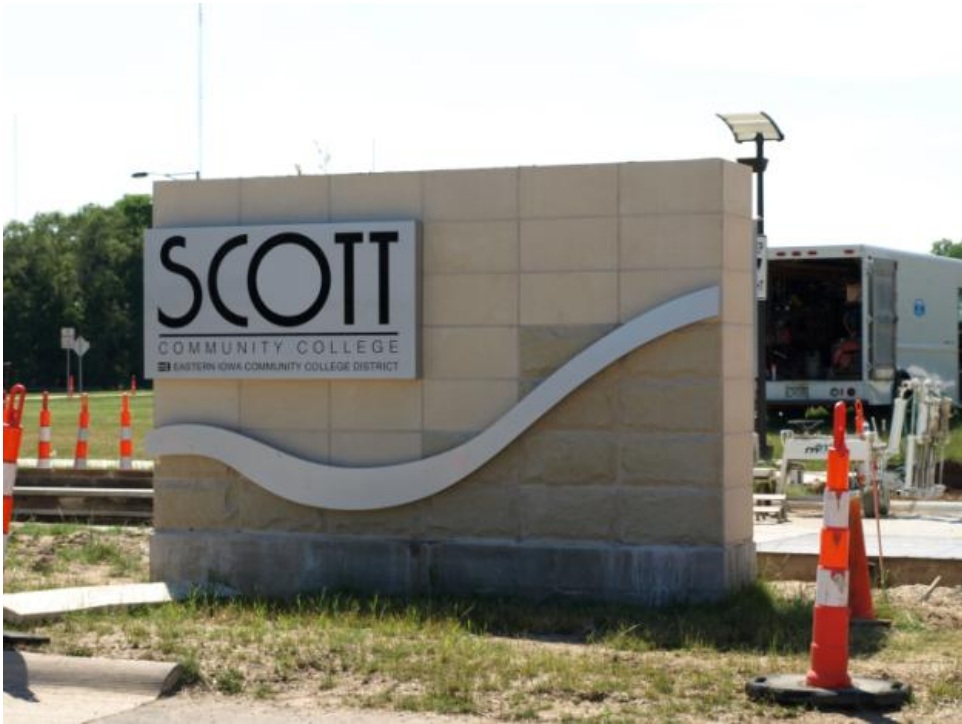
SCC Belmont Entrance Project