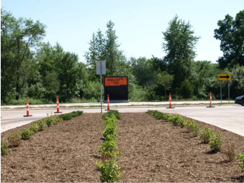
SCC Belmont Entrance Project