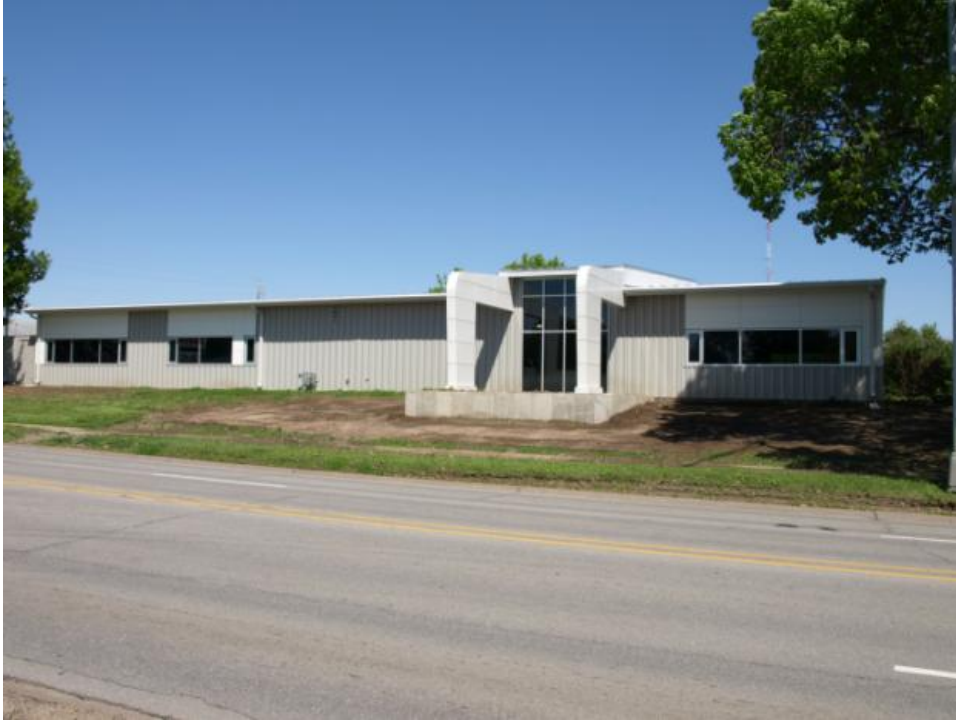
MCC Victor G. McAvoy University Center