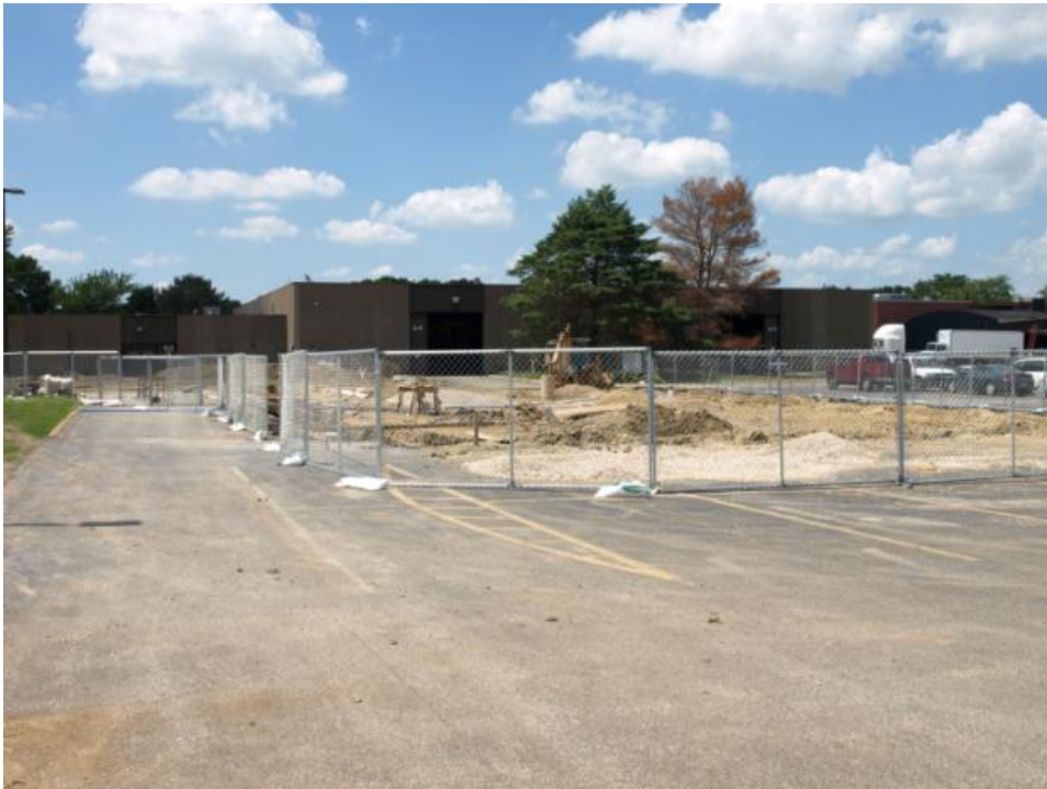
SCC Applied Technology Addition/Renovation Project