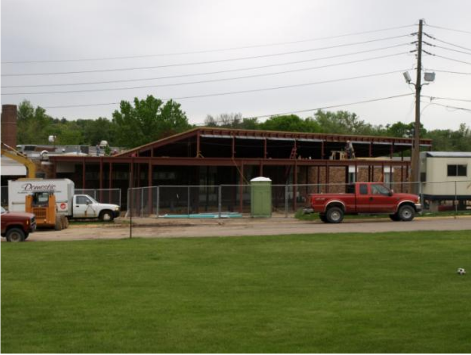
CCC Science Addition