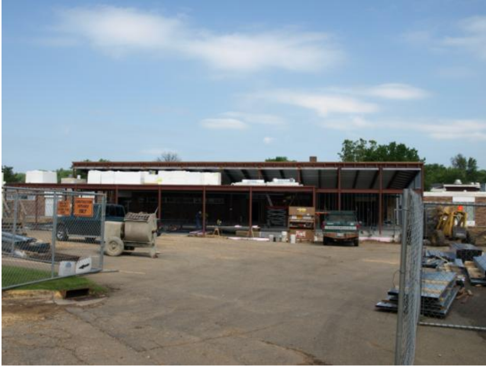
CCC Science Addition