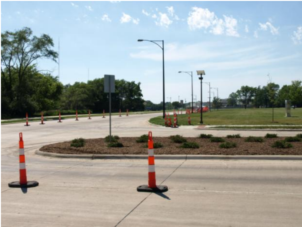
SCC Belmont Entrance Project