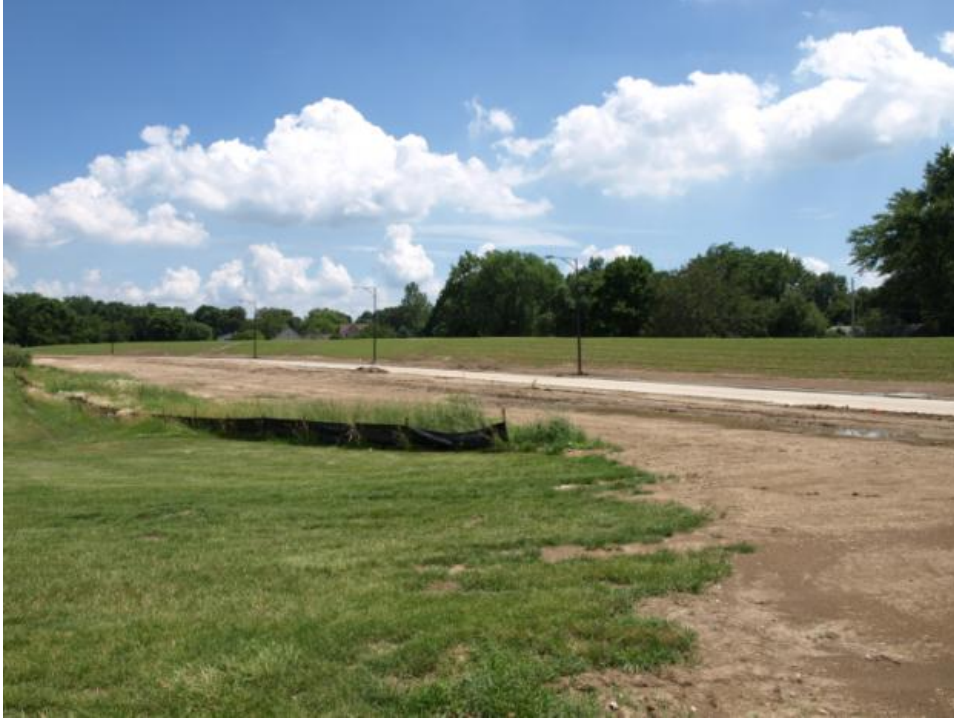
SCC Highway 67 Second Entrance Project