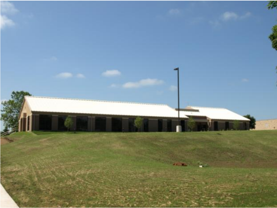
CCC Maquoketa Center