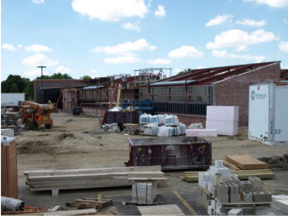
SCC Science Addition