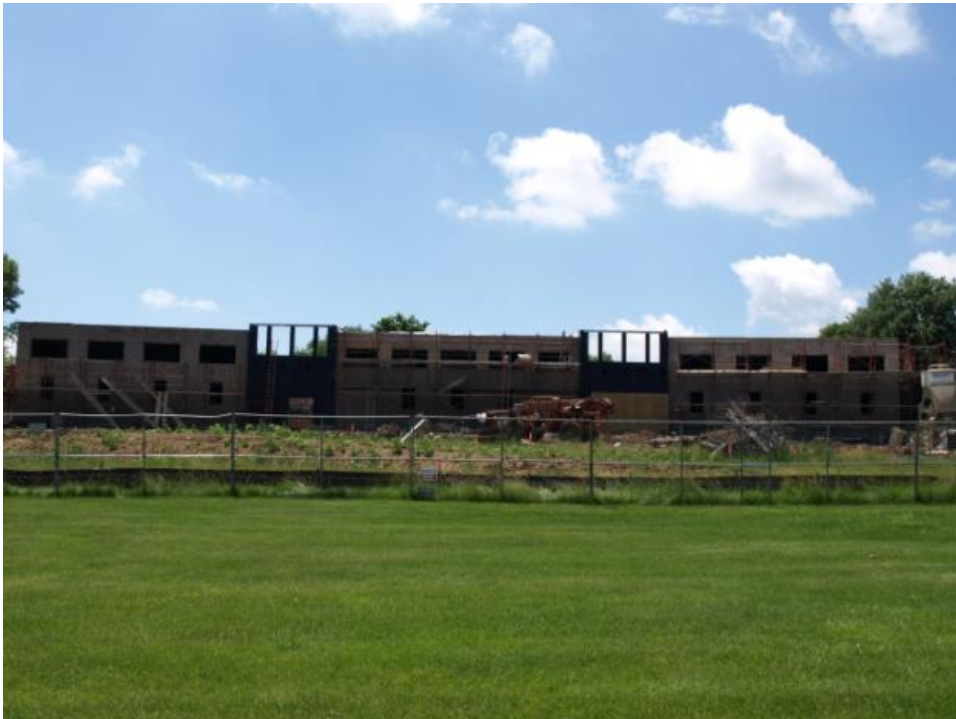
MCC Science Addition