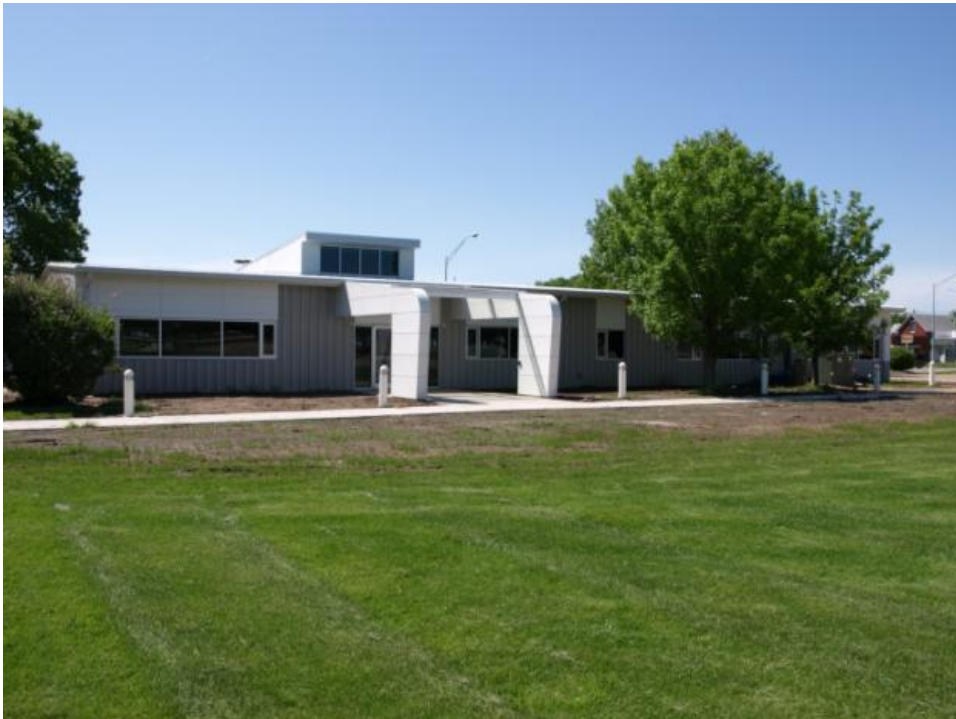
MCC Victor G. McAvoy University Center